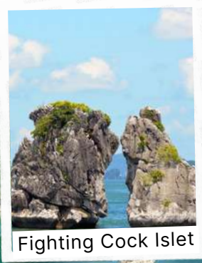
Fighting Cock Islet