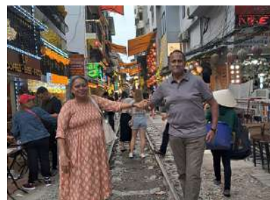
Hanoi's Old Quarter