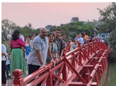
Ngoc Son Temple

Distance Noi Bai Airport – Hanoi Central: 35km -> 45 minute transfer