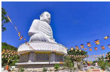
Linh Ung Pagoda