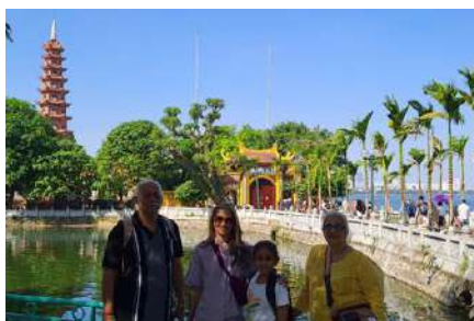
Tran Quoc Buddhist Pagoda